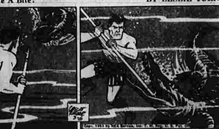
Have A Bite? BY LESLIE TURNER