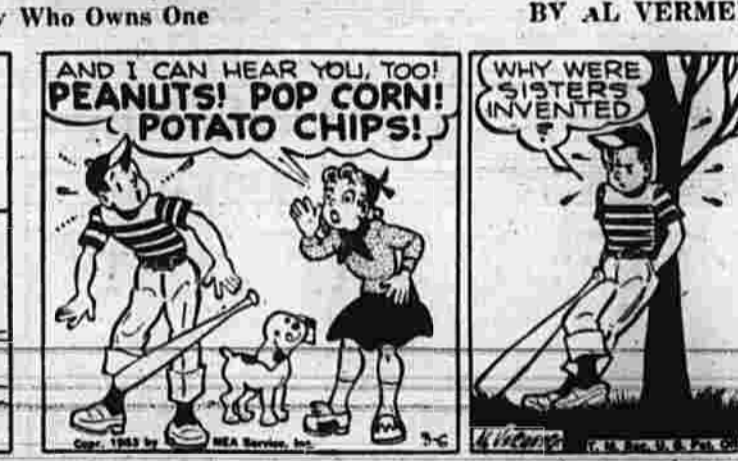
Ask the Boy Who Owns One BY AL VERMEER