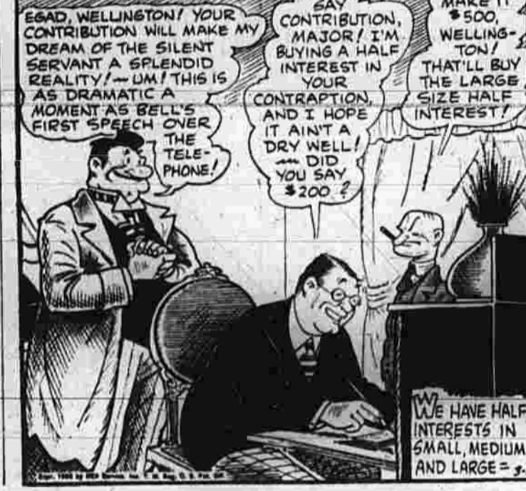
Back in Old Moo BY V. T. HAMILIN